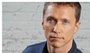
TOM RATH Author StrengthsFinder 2.0